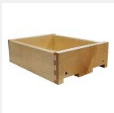
Drawer sample with left and right drawer notches

The Cantek JEN60 Drawer Notcher is designed to both notch and drill drawer boxes to install undermount soft-close drawer slides. The operation of the machine is simple with a self-indexing drilling unit that's determined by the position of the drawer for either left or right notching. With a cycle time of approximately 10 seconds per drawer, you can achieve a high throughput and save time for other important tasks.