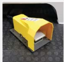
Convenient foot pedal operation