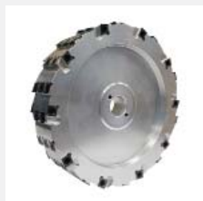
2 1/4" wide aluminum body insert knife cutterhead with replaceable carbide insert knives