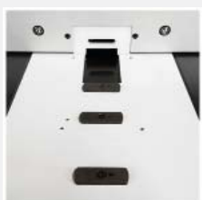
Simple drawer location stops and left and right limit switches for drill location