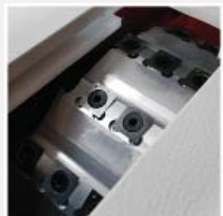
Insert cutterhead remains below the table under a guard until in operation