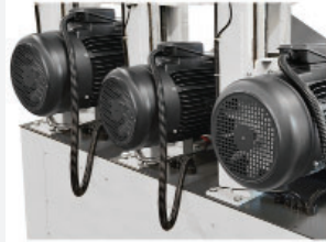
Powerful 10 HP motors