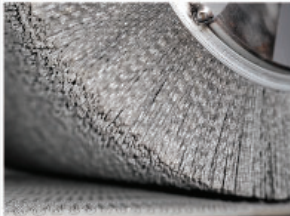
1st Head: Wire Brush Head Medium Structuring