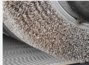
2nd Head: Wire Brush Head Light Structuring