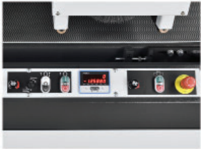
Ergonomically located machine controls for operator convenience

The Cantek BS600-3H 3-head wire brush machine is designed to remove the soft grain between the growth rings to produce distressed wood flooring, paneling, and more. Following the wire brush heads is a nylon brush that is designed to remove any raised fibers that appear from the wire brushing. With variable frequency inverters to control the brush RPM and feed speed you have ultimate control over your finished aesthetic.