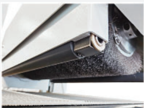
Spring loaded rubber hold down rollers before and after each brushing unit