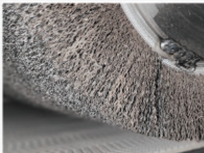
3rd Head: Abrasive Nylon Brush Tynex