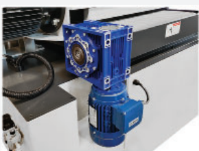
1 HP feed motor