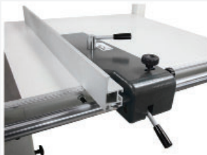
Heavy duty rip fence