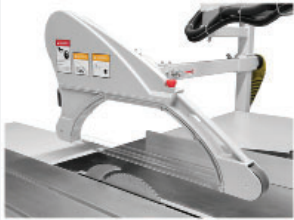
CE overarm dust collection & safety guard

The Cantek D405A Sliding Table Saw is the ideal sliding panel saw for high accuracy cutting of sheet materials to produce kitchen cabinetry, furniture, millwork operations, and more. This is our most industrial saw with manual setting rip fence. The 10' sliding table is made from a precision aluminum extrusion and runs on precision linear guide rails. It has motorized rise/fall and tilt of the blades.