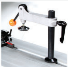
Eccentric workpiece clamp