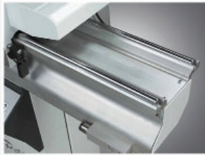
Precision sliding table