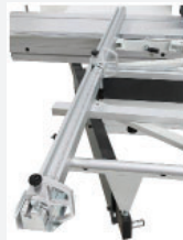
Crosscut miter fence