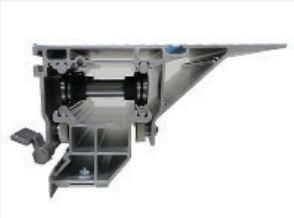
Precision sliding table sectional view