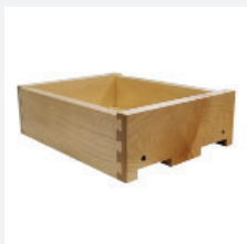
Drawer sample with left and right drawer notches

The Cantek JEN60 Drawer Notcher is designed to both notch and drill drawer boxes to install undermount soft-close drawer slides. The operation of the machine is simple with a self-indexing drilling unit that's determined by the position of the drawer for either left or right notching. With a cycle time of approximately 10 seconds per drawer, you can achieve a high throughput and save time for other important tasks.