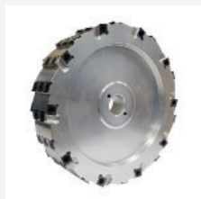
2 1/4" wide aluminum body insert knife cutterhead with replaceable carbide insert knives