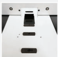
Simple drawer location stops and left and right limit switches for drill location