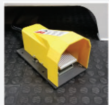
Convenient foot pedal operation