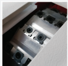
Insert cutterhead remains below the table under a guard until in operation