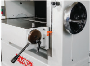
Quick adjust to table rolls

The Cantek P24HV 24" Planer has a cast iron table and head assembly with robust welded steel frame results in superior planing finish due to greatly reduced vibration. The spiral insert knife cutterhead runs extremely quiet and the solid carbide inserts provide a smooth finish and have a long life. When one edge gets dull simply rotate the knife 90 degrees for a new cutting edge. Knives can be rotated four times before needing to be replaced.