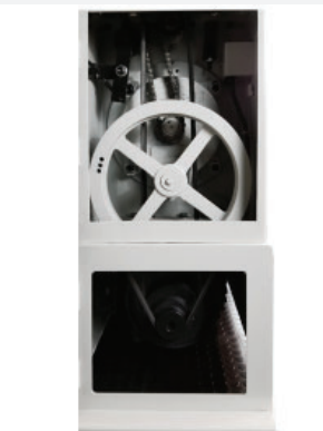
Feed mechanism and machine frame