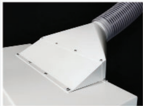
6" dust port