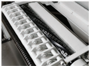
Spiral insert knife cutterhead