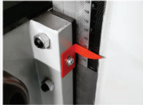
Table adjustment indicator