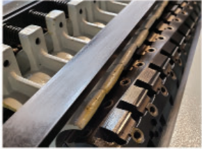
Spiral Insert cutterhead

The Cantek P508HV 20" Planer has a solid steel helical cutterhead with two-sided carbide knife inserts that require no adjustments when changing. With a digital readout and simple PC controller, setting the table height is quick, accurate, and easy. The frame is made from heavy cast iron with known vibration damping resulting in long bearing life and superior cut quality. The planer's segmented, serrated infeed roll & segmented pressure shoe ensures material is held firmly during the feeding and planing process. The P508HV planer has a quick-set micro-adjustable lever that easily raises and lowers the table rollers to aid in the feeding of difficult to feed wood. The industry standard 30x12x1.5mm carbide insert knives are positioned by two pins and held by a gib and screw which do not require any special tools to set the height. The knives have a slight bevel in the corners which provide for a superior finish without any stepping between the knives. In addition, the knives sit vertically into the head which produces a proper cutting angle and gully to allow for superior cutting depth.