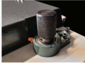
Micro thickness adjustment