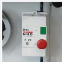
CSA / UL approved magnetic switch