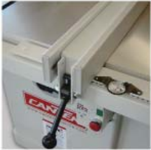
T-square 50" rip fence

The Cantek TA Series Table Saws are for serious woodworkers and production shops that require an industrial strength and powerful table saw. The large precision-ground & polished cast-iron table and cast-iron saw unit ensure vibration free cutting with optimum cut quality. The quick setting T-square rip fence is equipped with dual inch & metric scales for precise rip cutting. The blade guard is mounted to a splitter with anti-kickback pawls for safe operation. Comes standard with both standard and dado arbors and table inserts. Driven by a powerful motor to make the cuts you need effortlessly.