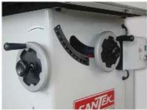
Blade height and tilt adjustment handwheels