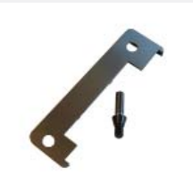
Dado arbor and insert