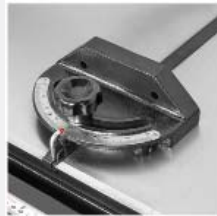
Miter gauge with T-miter slot on both sides of the table